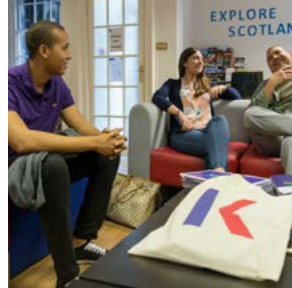
The student common room

There are places of worship for all religions and faiths close to the school. A list of these and their locations is in the welcome pack.