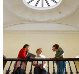
The interior of the school is spacious and light