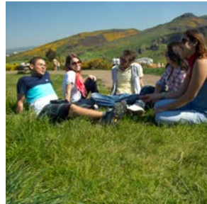
Activities program includes optional hikes in the magnificent Scottish highlands