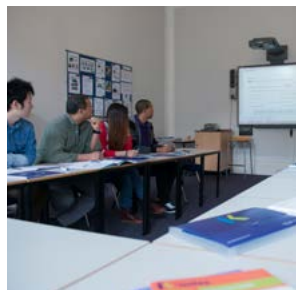
Kaplan students in a classroom

A full and varied social program is organised each week. Please see overleaf for an example timetable.